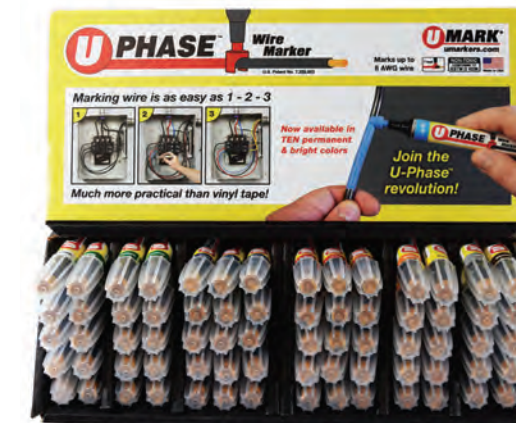
10719PMD Large Display

Markers in displays are individually shrink-wrapped.