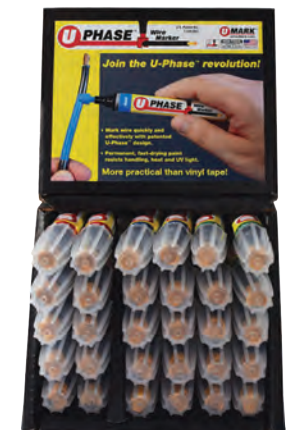
10720SMD Small Display