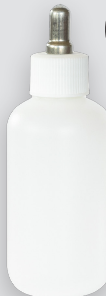
2 oz Bottle w/ 2 mm Tip Item# 40616DZ

Markers are supplied empty and are sold in sets of 12 units