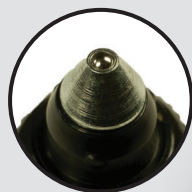
4 mm Tip