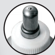
2 mm Tip